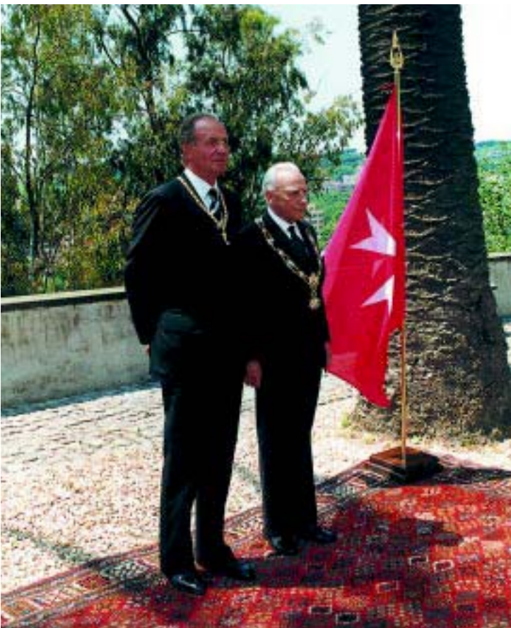
His Majesty, King Juan Carlos of Spain, with the Grand Master of the Order, Fra' Andrew Bertie.