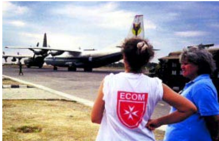
Dili Airport, East Timor: Emergency food supplies arrive for the 300,000 refugees fleeing the civil war, under the surveillance of an Order of Malta ECOM emergency relief work volunteer.

Ambassadors' missions are strictly humanitarian. However, in countries without a National Association, the ambassador is also responsible for coordinating hospitalier activities.