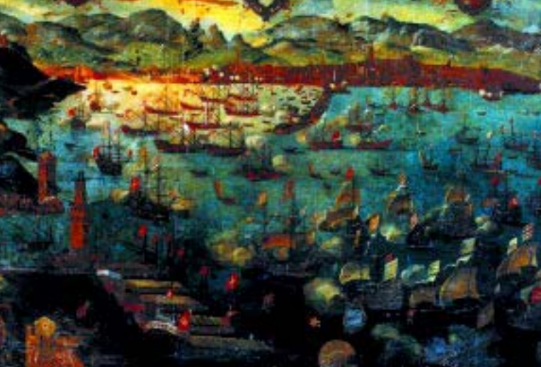
< Palma de Majorca